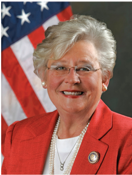
Kay Ivey, Governor of Alabama