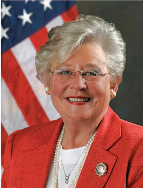
Kay Ivey, Governor of Alabama