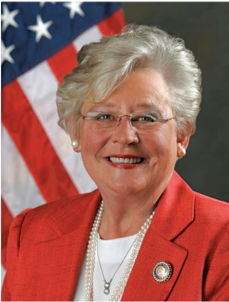
Kay Ivey, Governor of Alabama