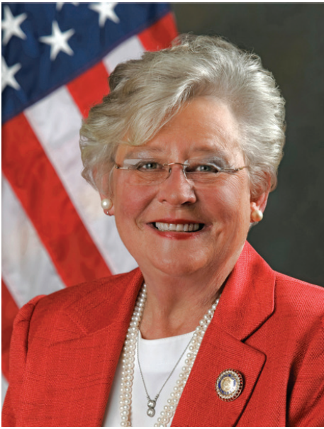
Kay Ivey, Governor of Alabama